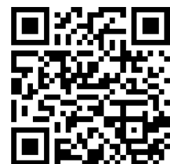
QR to link 2